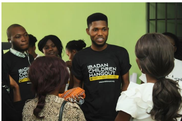
Some of the Volunteers for 'Ibadan Children Hangout'

Training was organised for volunteers who showed interest in being a part of the Ibadan Children Hangout. This training held at Mellanby hall, University of Ibadan for about 2 hours. There was also a virtual training session for those who could not be present. They were taught on how to engage the community, how to catch and retain the children's attention among other things. Branded t-shirts were given to each volunteer to be worn for the program.