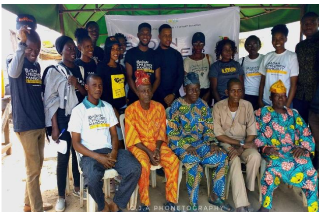
With some community leaders during awareness program