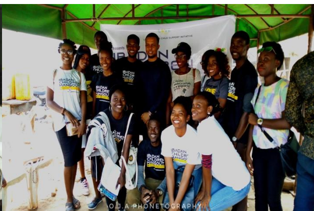
Group picture with volunteers after the community awareness program