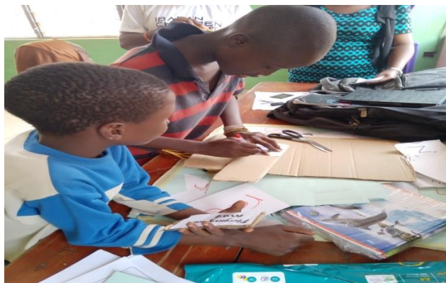
Children engaged in an activity at our learning space in Beere

We launched the Pilot Learning Space in Beere on March 19, 2019. We have gradually grown from six (6) children who attended the first session to 10 children. We witnessed notable transformations in each of these children; ranging from improved literacy skills to positive change in behaviour. Click here to read more