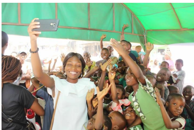
A Bramble volunteer taking selfie with some children during the awareness program

on) and they were spoken to about education and life in general. The parents (about 15) who had also come together were required to proffer solutions to the education related challenges in the community. This participatory approach was employed to make them know that their opinion mattered so much and that the proposed project was theirs and not forced on them. To read a full report of this awareness program Click Here