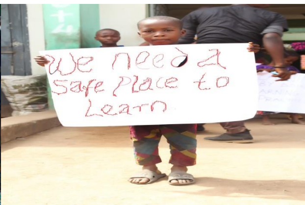
Highlight: There is a dire need for spaces where children can have access to quality learning