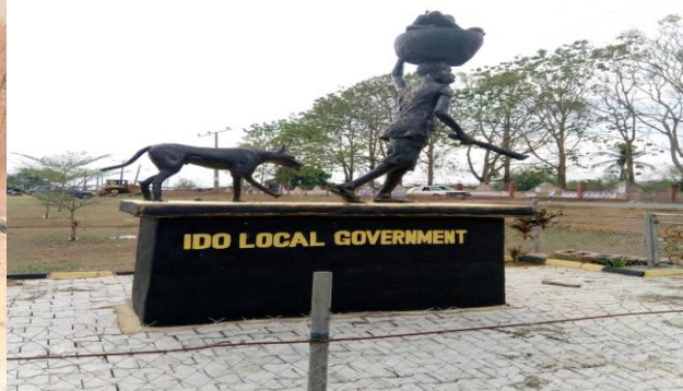
Ido Local Government, Ibadan Nigeria. One of the several communities we have mapped