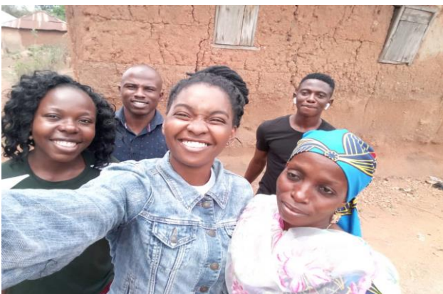
Bramble Team and a community guide during community mapping

Ibadan has eleven local government areas scattered across 3080km land mass. In order to identify the suitable location for our Bramble residential learning space, we conducted a thorough mapping exercise in rural communities across Ibadan. During the Community Mapping exercise, we collected data which helped us gain insight into the existing assets and resources within selected rural communities. We have been able to map 9 communities altogether. These include Abule Oderemi, Aba Asipa, Abule Gbengbin, Aba Patako, Abule Apotipopo, Aba Faomi, Abule Aremu, Aba Araba, and Ejioku. Click here to read more