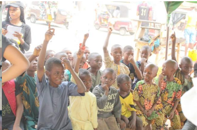
Some children during our community awareness program in Beere community