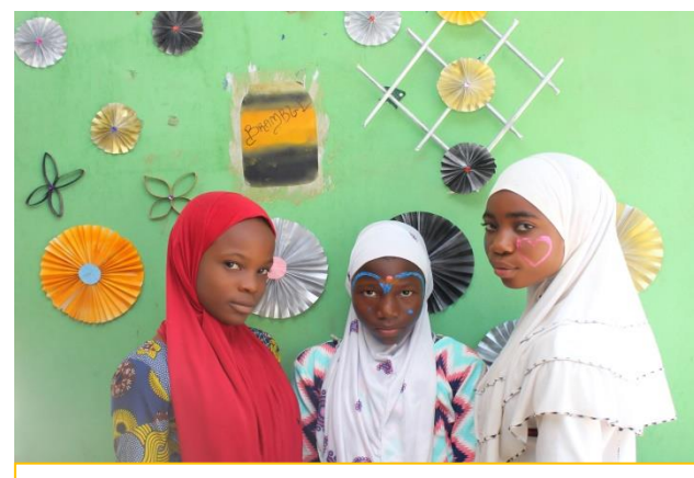
Some of the girls who participated in our origami workshop at the pilot learning space

Dear readers, thank you for your interest in our newsletter. We are glad to take you through the highlight of our activities in these past months. We are especially grateful for the positive feedbacks we received after our first Newsletter; each was invaluable. Enjoy as we take you through it all.