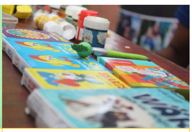
Some Learning materials used at the Pilot learning space